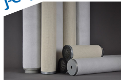
Models PMGRF, MGRF