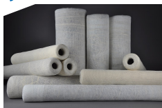
Models FT, FTS, FMP, GF, WC, PCL

The traditional liquid sock filter. These rolled depth elements provide filtration through multiple layers of controlled density filter media formed into a mat and rolled onto a core.