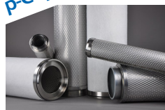
Models CIO, NGGC PL-51