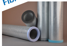
Models FF, FFP