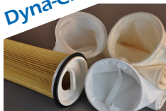
Models PO, PE, A, W/PO, W/PE, PEM, NM, PMO, NMO, BR

A wide variety of filter bags are available designed to fit most bag vessels on the market.