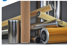
Models CF, FI