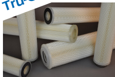
Models CP, CPC