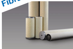
Models FG, FGGF, BFG, KFG, PPFG