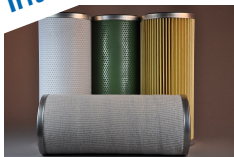
Models C, CB, CC, CR, SP, SS, ST

High quality coalescer and separator elements for phase separation of two immiscible fluids. One of the most common applications is removing emulsified water from hydrocarbon fluids.