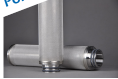
Models PP, PM, PF