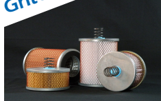
Models PEPP, PEPS